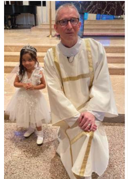
Photos from July 29/30 Weekend Masses